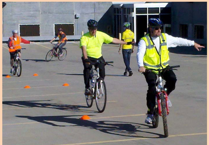
Bike Ed Class with MoDOT staff

In the next 5 years, we will reduce the rate of pedestrian and bicycle crashes and injuries per trip around Missouri by one third. We will promote and encourage motorist education programs and activities and work with law enforcement to encourage appropriate enforcement activities to promote safety for all road users.