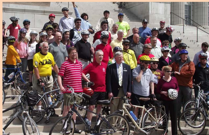
Capitol Day in Jefferson City, April 2011

In the next 5 years, we will gather thousands of active members from every part of the state of Missouri and work together to create a new movement in support of bicycling and walking. We will build partnerships and coalitions with like-minded organizations to expand our influence.