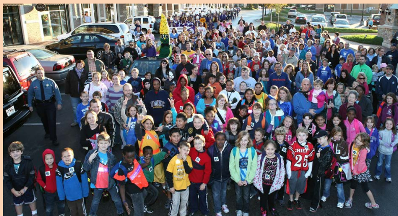
Walk to School Day at Briarcliff Elementary, October 2011

In the next 5 years, we will promote, encourage, and conduct programs and campaigns throughout the state that increase active transportation for all users. We will help communities develop and implement these efforts.