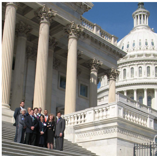
Missouri delegation to the National Bike Summit

More information about our current and past Legislative Platforms: MoBikeFed.org/platform.php